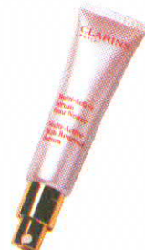
Multi-Active Serum by Clarins