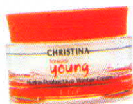
Hydra-Protective Winter Cream by Christina