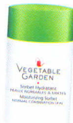
Moisturizing Sorbet by Vegetable Garden at April