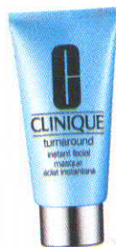
Clinique Turnaround Instant Facial Masque